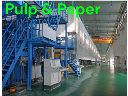
Pulp & Paper